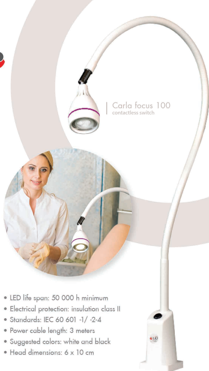
Carla focus 100 contactless switch